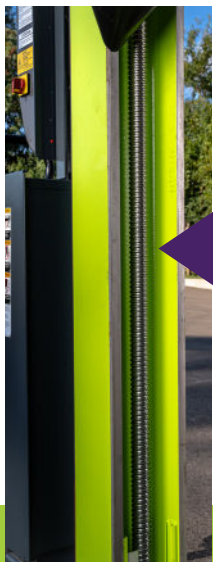
Recirculating stainless steel ball screw